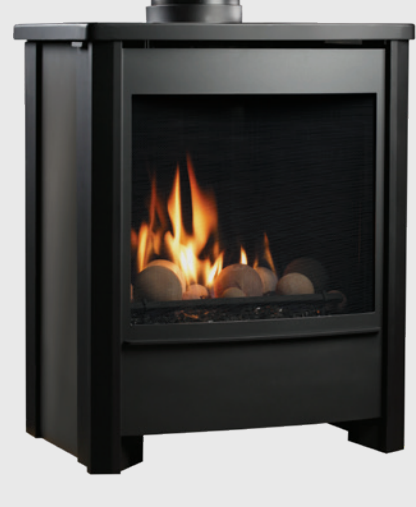
FDV451N Free Standing Direct Vent Stove - Natural Gas, F450FBL Door Front - Charcoal with Black Posts, F451SDSBL Side Doors - Solid Charcoal Panel with Black Frame, MQG5C Bronze Glass (x3), RBCB1 Cannonballs, F45LG Log Grate, F45FK Fan Kit.