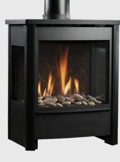
MQFDV453N Free Standing Stove - Natural Gas, F450FBL Door Front - Charcoal with Black Posts, MQ453SDBL Side Doors with Black Frame and Charcoal Panel, MQG5C Bronze Glass (x3), MQSTONES Decorative Stones, MQ451RLH Herringbone Brick Liner, F45FK Fan Kit.